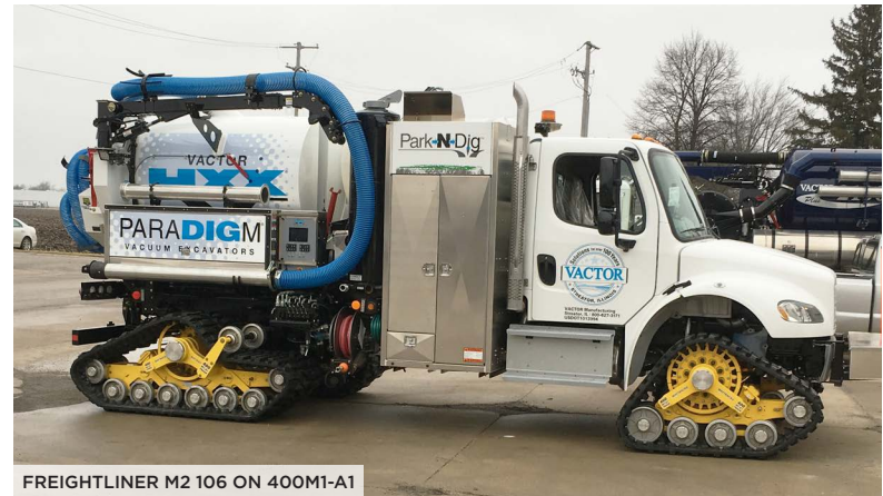
FREIGHTLINER M2 106 ON 400M1-A1